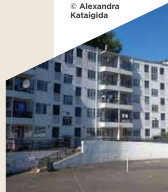
Below SPID Theatre