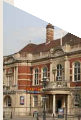
Above Battersea Arts Centre

Kensal House Community Rooms is home to SPID Theatre, a 140-seat hall which lies at the heart of the community rooms of the Grade II* Modernist council estate in Ladbroke Grove. Over the past seven years SPID has renovated and fitted out the space, and will now carry out urgent works to replace doors, and install access ramps and double glazed windows to ensure that the local community has access to a well maintained, fully-functioning theatre it can be proud of. www.spidtheatre.com